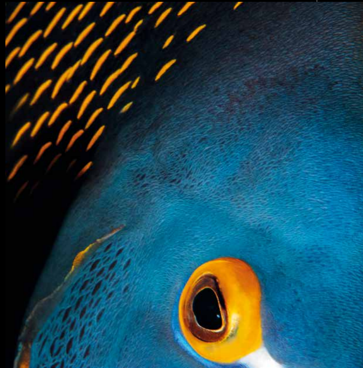
An unusual crop of a French angelfish makes a powerful, near abstract image