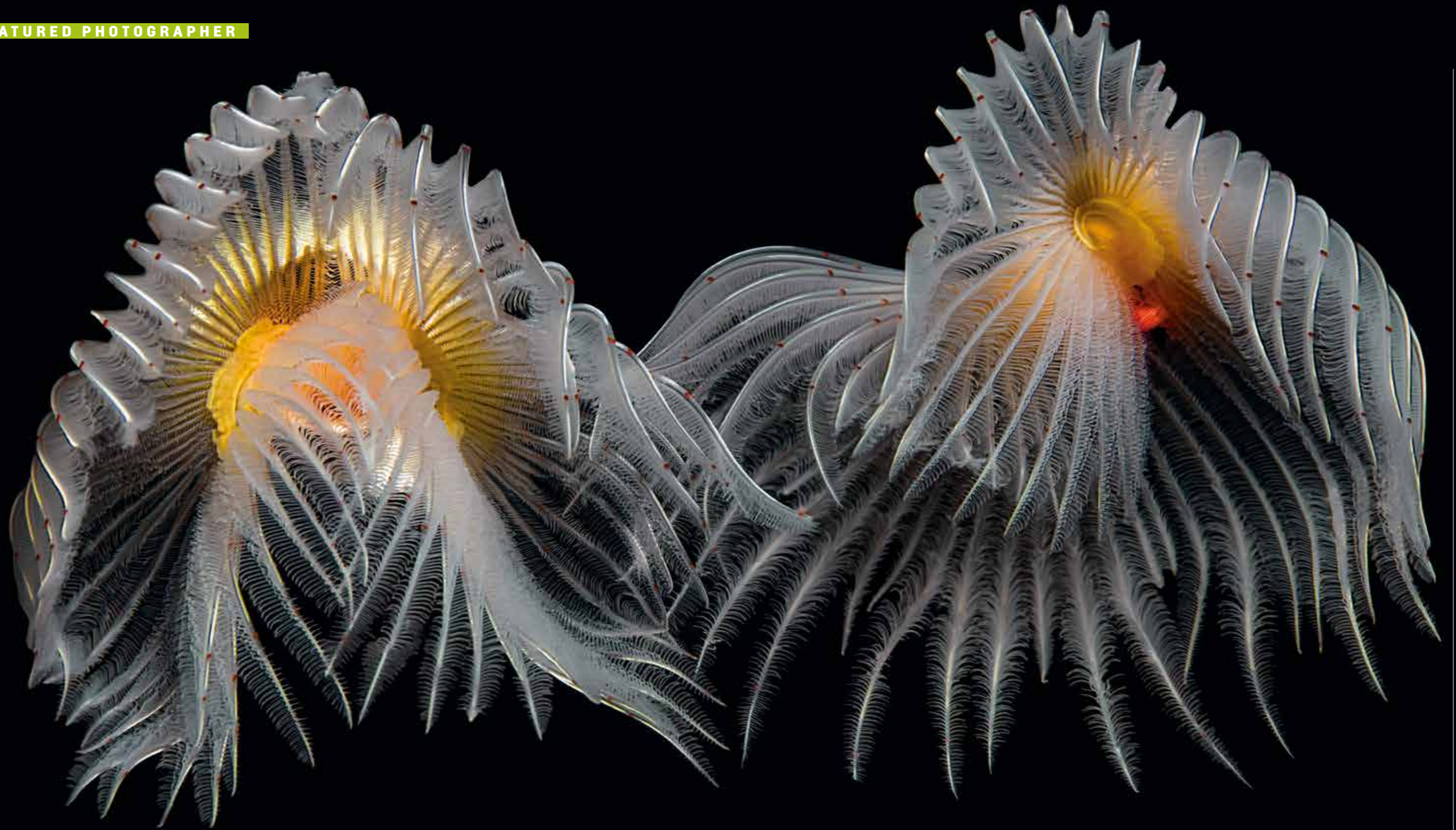
Using a Retra LSD snoot to light these delicate white-tufted worms makes them appear to be dancing on a darkened stage